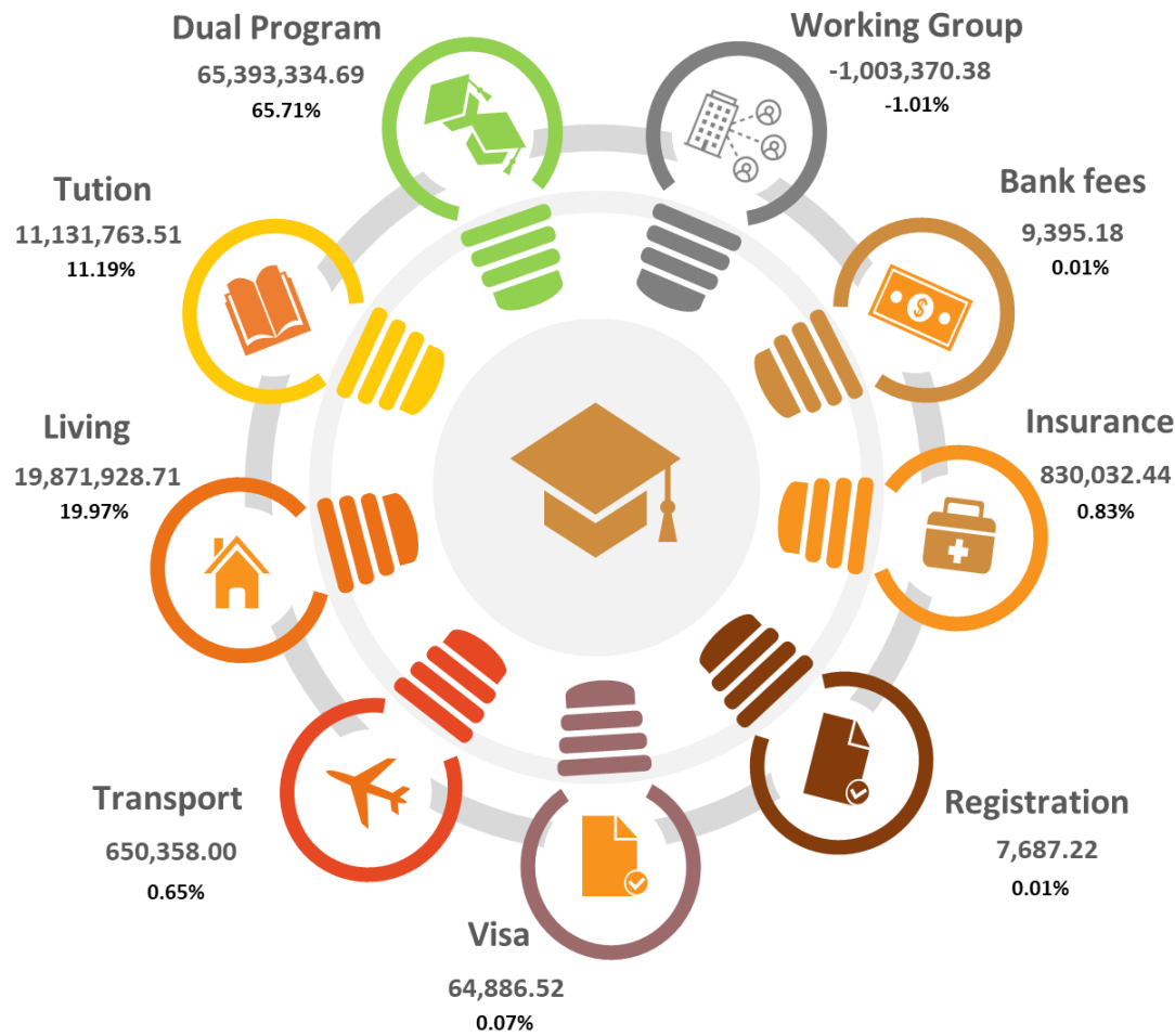
Fund allocation by expenditure items within the State Program (AZN)

The majority of doctoral students at foreign universities study Economics and Management (24%), Natural Sciences (22%), and Health and Welfare Studies (14%).